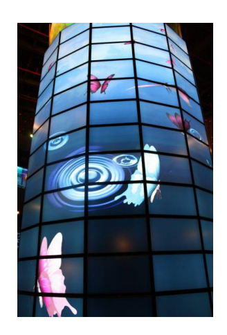
Figure 6. Samsung MagicInfo VideoWall can present high-impact content across as many as 250 LFD units.

With MagicInfo VideoWall Edition, companies can customize content display with one of two media players.