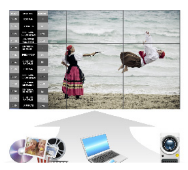
Figure 2. Various types of media, PC screen and live camera can be displayed on VideoWall.

Information housed in the MagicInfo Premium Server or a LAN can be combined and displayed. Content can be scheduled, shuffled and played on programs timed down to a specific second, hour, day, week or year.